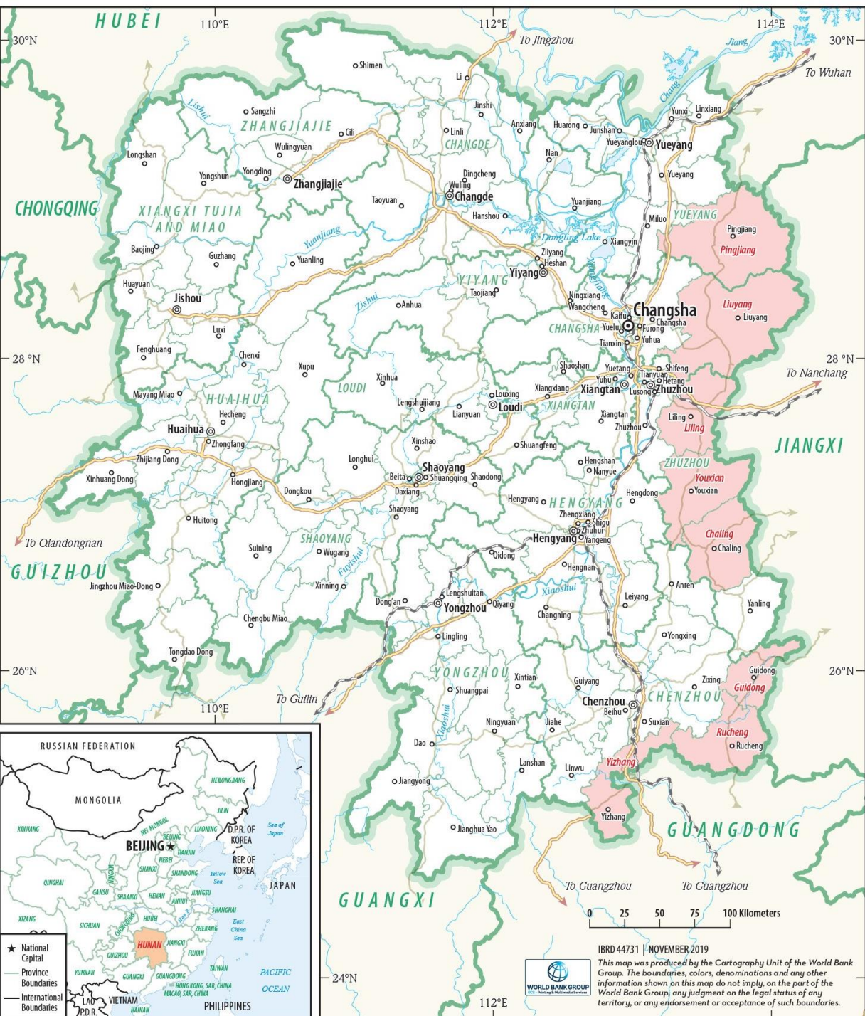
Table 1: Key Statistics of 8 Selected Counties