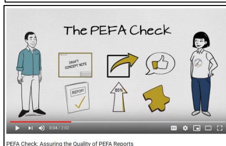
PEFA Check: Assuring the Quality of PEFA Reports