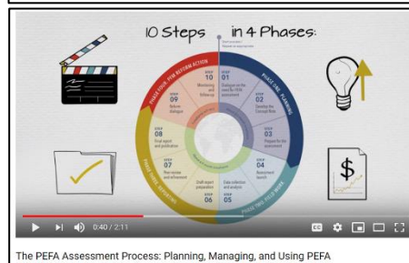
The PEFA Assessment Process: Planning, Managing, and Using PEFA