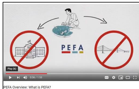
PEFA Overview: What is PEFA?